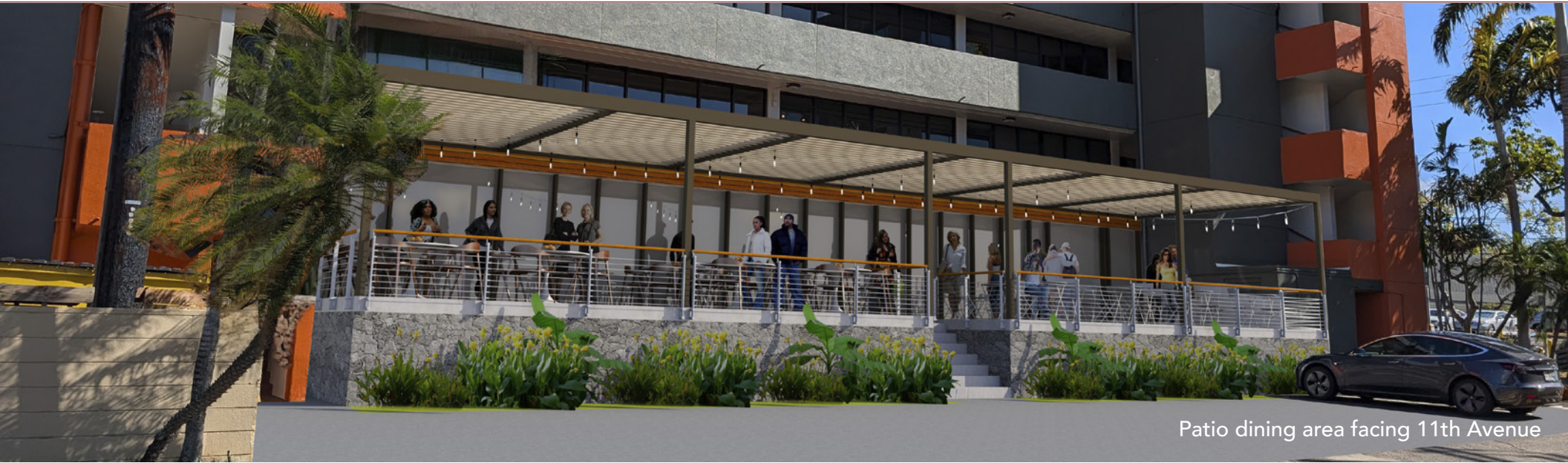
Patio dining area facing 11th Avenue